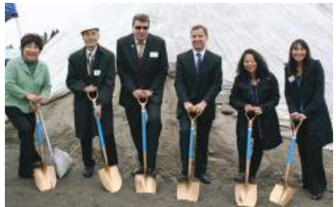
In fall, 2014, ICHS finished construction of a new three-story, 40,000-sq.-ft. medical and dental clinic along the busy Aurora Avenue corridor in Shoreline. It is the first non-profit health center in the city's history.