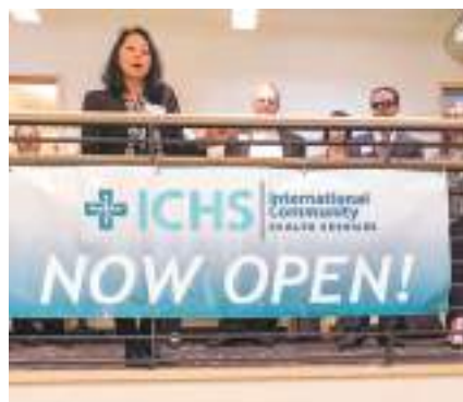
On May 1, 2014, ICHS made its first foray into the Eastside by opening a 6,500-sq.-ft. clinic in the Crossroads neighborhood of Bellevue.