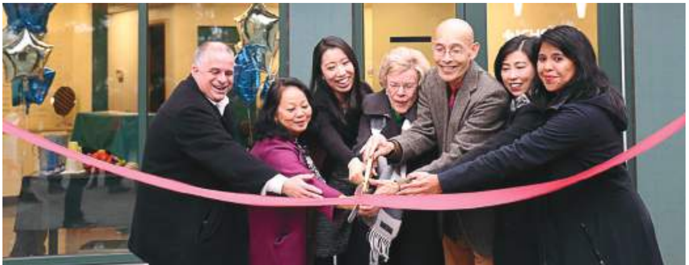
Celebrating our new vision clinic on November 6, 2017