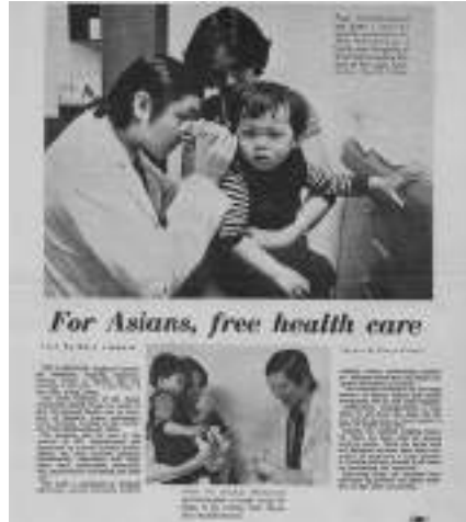
The Asian Community Clinic on Beacon Hill, the forerunner to ICHS, opened in the summer of 1973. It was a free clinic staffed by volunteers.