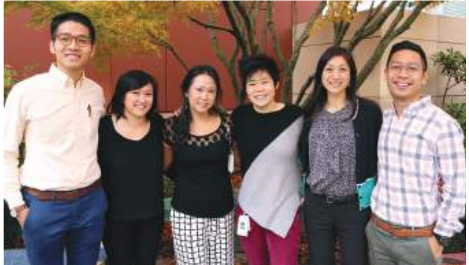
Welcoming a new group of family practice residents