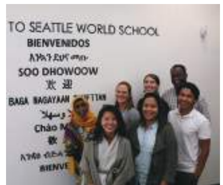
In spring, 2011, ICHS opened a clinic at Seattle World School to serve diverse newcomer students and their families. In early 2018, ICHS opened its second clinic at Highland Middle School in Bellevue.